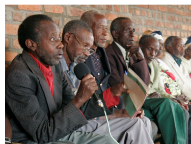
Community meeting where participants deepen their knowledge of their rights.