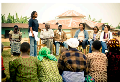
USAID promotes the use of alternative dispute resolution mechanisms, such as local Abunzi councils, where solutions are achieved without resorting to the formal court system.

Many civil society organizations in Rwanda have low capacity in project management and financial management, limiting their opportunities to receive donor funding. USAID supports training for CSOs to build the necessary skills for success and sustainability.